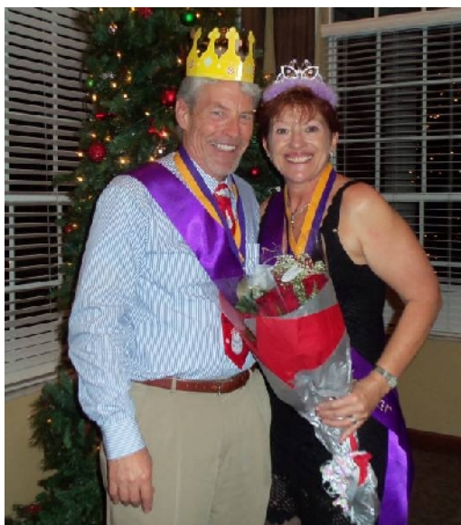
Couple of the Year