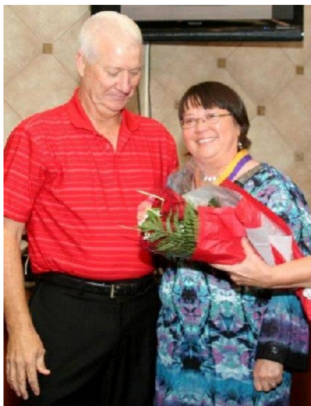
Individuals of the Year